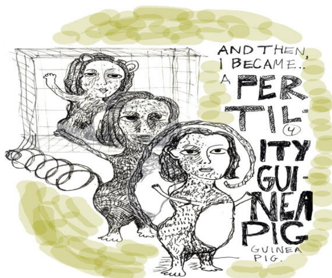
Figure 3: Woman reduced to the status of a pig in the fertility clinics. (Steinberg, 2014)

In Good Eggs , Potts expresses a strong criticism towards infertility clinics, viewing them as both exploitative and degrading. The author ironically refers to the clinic as a “fertility factory, a massive institution built on centuries of medical expertise, millions of dollars in salaries, a wide range of drugs sourced globally, and countless hours billed to legal teams and advertising agencies” (Magee, 2019). Good Eggs also exposes the inhumane aspect of insurance firms, who demand that individuals utilize the most cost-effective alternatives before seeking more coverage. In The Facts of Life , Knight portrays the myth of modernity, progress, and liberation brought about by science through a flowchart that represents significant cultural and scientific achievements (Boer, 2020). The artists challenge the exaggerated promises of science and reveal the underlying political dynamics of healthcare by portraying their personal interactions with infertility treatments and clinical settings.