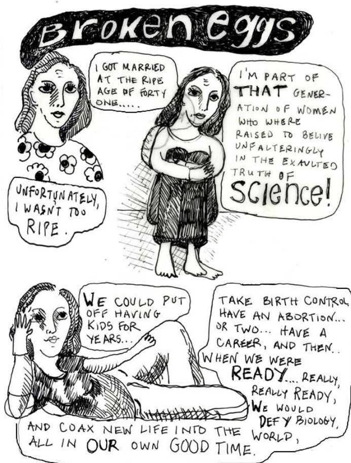
Figure 2: False promises of a scientific system that does not deliver. (Steinberg, 2014)

deconstruct the prevailing account of modernity, which exhibits an unwavering belief in the capacity of science to improve the human condition and expand its potential. Steinberg claims to belong to a generation of women who were taught to have unwavering faith in the esteemed validity of science. The author's deliberate use of capitalizing the word 'THAT' indicates that the current generation no longer possesses unwavering trust in science, as postmodernity has revealed the unrealistic ideals of modernity. Women from Steinberg's generation were encouraged to use contraception and pursue a career in life because with science at their disposal, procreation at the ripe age of forty-one was "eminently doable" ( Broken Eggs ). The picture below demonstrates the argument presented above: