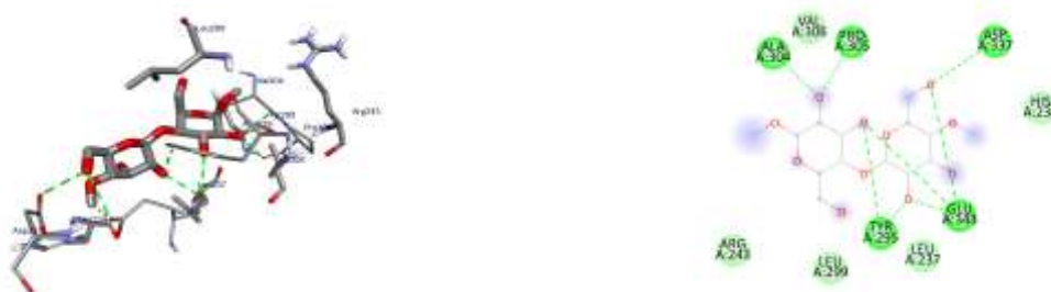
Molecular docking scores and residual amino acid interactions of compounds against Protein (PDB ID: 4RBM).